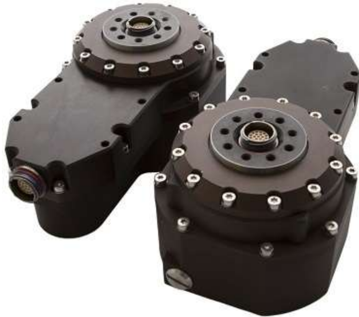
Servo Actuators designed around Servosila SC-series Servo Drives

YouTube: http://www.youtube.com/user/servosila