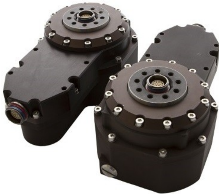
Servo drives designed around SERVOSILA SC-25C brushless motor controllers

YouTube: http://www.youtube.com/user/servosila www.servosila.com/en/motion-control